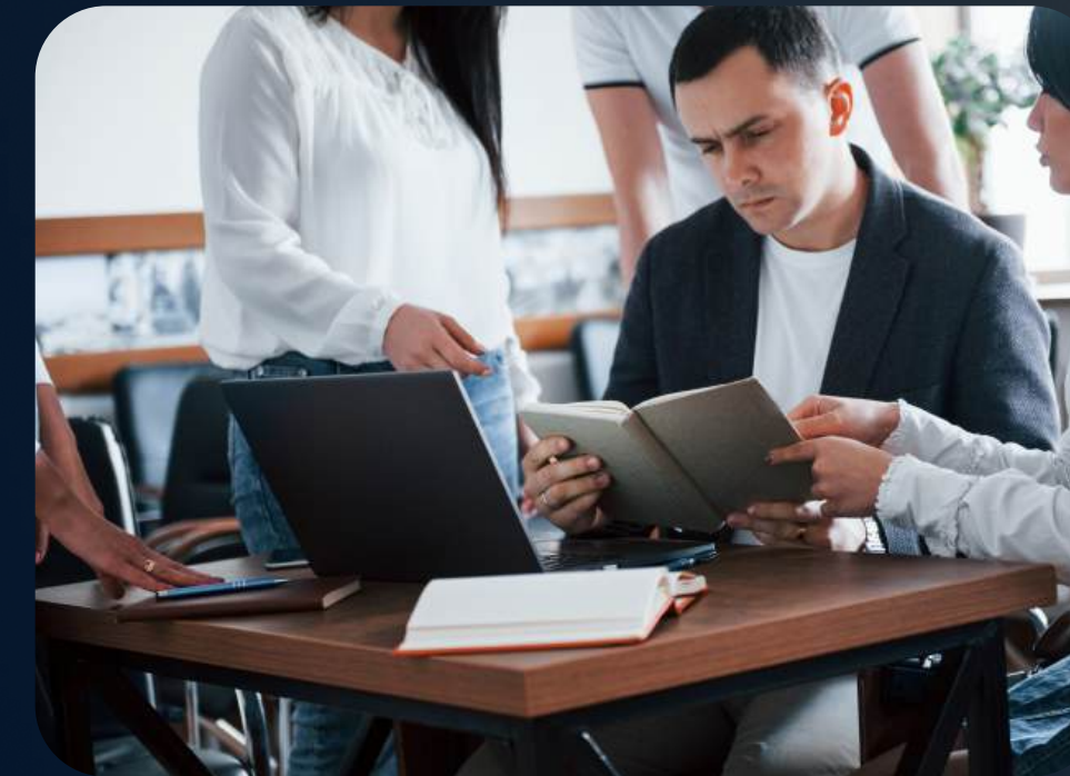
NYU MBA Program

30+ full-day keynotes and training programs across industries including real estate, manufacturing, and aerospace