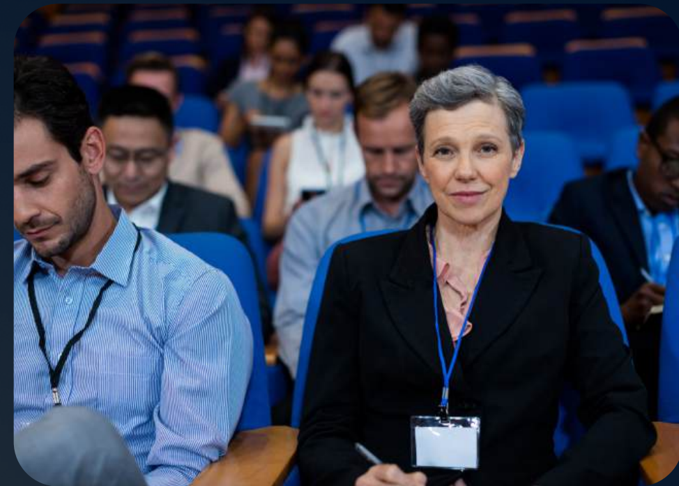
YPO Chapters (NYC, Boston, Kansas City, Miami)