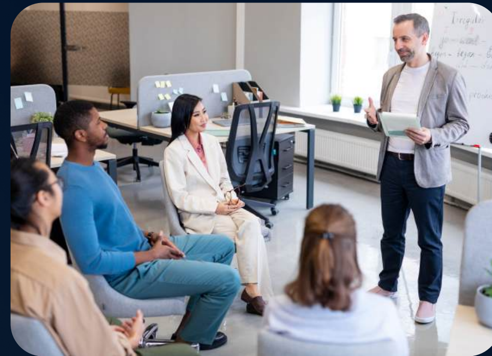
Harvard Executive Education